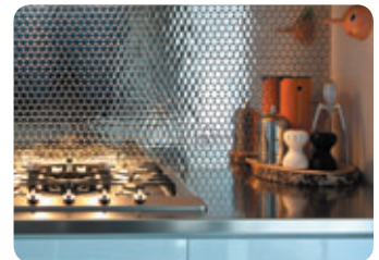
Installed: ALLOY Dollar tile in mirror polished stainless steel